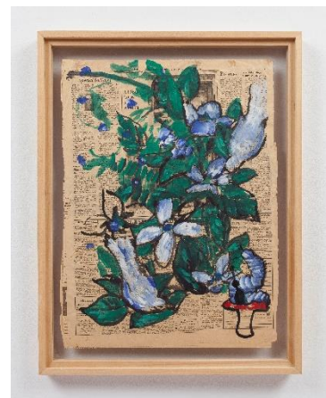
Paul Thek, Untitled (Birds and Mushroom) , c.1969, gouache and collage on newspaper, 23" x 17". Courtesy Alexander and Bonin, New York. Photo: Jorge Lohse © The Estate of George Paul Thek

Paul Thek (born 1933, Brooklyn, NY; died 1988, New York, NY) was a leading postwar artist whose paintings, sculptures and installations employ complex iconography, mythic allusions, recognizable imagery and biographical references. Thek studied at the Art Students League of New York and Pratt Institute, Brooklyn, NY, before attending The Cooper Union for the Advancement of Science and Art, New York. In 1977, Thek was the subject of the solo exhibition Processions at the Institute of Contemporary Art, Philadelphia, PA. His work has been exhibited widely, including posthumous solo exhibitions at the Hammer Museum, Los Angeles; Alexander and Bonin and Whitney Museum of American Art, both New York, NY; and Carnegie Museum of Art, Pittsburgh, PA; as well as Fundació Antoni Tàpies, Barcelona, Spain; Neue Nationalgalerie, Berlin, Germany; Pace Gallery, London, UK; Museo Nacional Centro de Arte Reina Sofia, Madrid; Musee d'Art