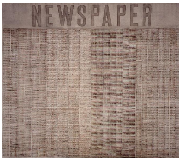
Chryssa, Newspaper , c.1962, transfer print and pencil on canvas, 104 ½" × 120 ½" × 1".

Chryssa Vardea-Mavromichali (born 1933, Athens, Greece; died 2013, Athens), known as Chryssa , was a pioneer of light art and luminist sculpture, made of neon, steel, aluminum and acrylic glass, that prefigured the Pop Art and Minimalist movements. Chryssa studied at the Académie de la Grande Chaumière, Paris, France and later attended the California School of Fine Arts, San Francisco. She has had solo exhibitions at Harvard University, Cambridge, MA; Solomon R. Guggenheim Museum and Whitney Museum of American Art, both New York, NY; Institute of Contemporary Art, Philadelphia, PA; and the Musée d'Art Moderne de la Ville de Paris, France. She has exhibited in group exhibitions at Castelli Gallery and The Museum of Modern Art, both New York; Princeton University Art Museum, NJ; and the European Cultural Centre of Delphi, Greece; as well as documenta 6 , 1977 and documenta 14 , 2017. Her work can be found in the collections of the Albright-Knox Art Gallery, Buffalo, NY; Whitney Museum of American Art and The Museum of Modern Art, both New York; as well as the National Gallery of Athens and National Museum of Contemporary Art, both Athens. Chryssa was a John Simon Guggenheim Fellow.