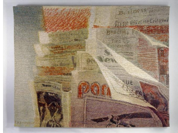
Helena Hernmarck, Front Pages , 1981-82, tapestry of wool, cotton & linen with discontinuous tabby weave and discontinuous pattern including soumak technique, 94" x 118 1/2".

Helena Hernmarck (born 1941, Stockholm, Sweden; lives Ridgefield, CT) is a textile artist whose work couples fleeting subject matter with a time-intensive format and contemporary design with folk history and tradition. She studied weaving at the Swedish Association of Friends of the Textile Arts and continued her studies at Konstfack University College of Arts, Crafts and Design, Stockholm, Sweden. Hernmarck has exhibited in numerous solo exhibitions including at the American Swedish Institute and Minneapolis Institute of Art, both Minneapolis, MN; New Britain Museum of American Art, CT; Museum at the Fashion Institute of Technology and The Museum of Modern Art, both New York, NY; American Swedish Historical Museum, Philadelphia, PA; and Aldrich Contemporary Art Museum, Ridgefield, CT; as well as the Zorn Museum, Mora, Sweden and the Prins Eugens Waldemarsudde Museum, Stockholm. She has been featured in many group exhibitions including those at the American Textile History Museum, Lowell, MA; Minneapolis College of Art and Design, MN; and American Craft Museum, New York, NY; as well as Victoria & Albert Museum, London, UK. Her work can be found in numerous public collections worldwide.