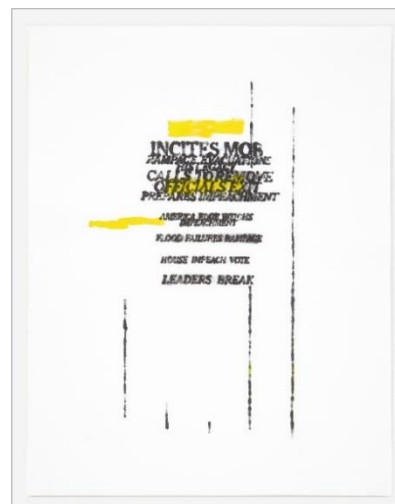
Jef Geys, Kempens Informatieblad (Fall 2003). Courtesy of Estate of Jef Geys; Rita Maas, January 7 - January 13, 2021 , 2021, from the series "Today I Got Up," Sharpie and reclaimed Epson ink, 22" x 17", unique. Courtesy of the Artist